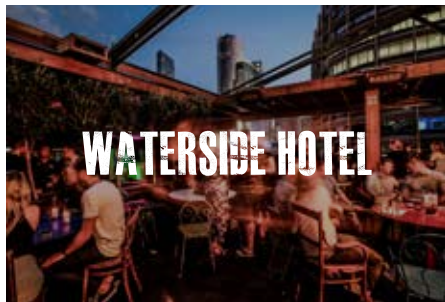
508 FLINDERS ST, MELBOURNE WATERSIDEHOTEL.COM.AU