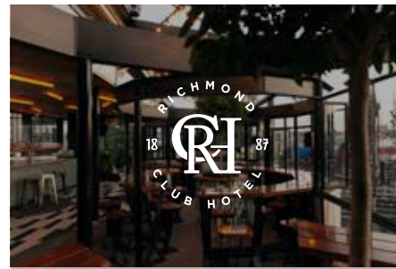
100 SWAN ST, RICHMOND RICHMONDCLUBHOTEL.COM.AU