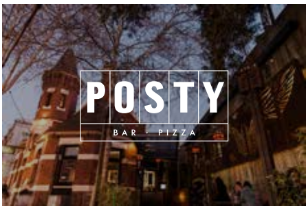
90 SWAN ST, RICHMOND THEPOSTY.COM.AU