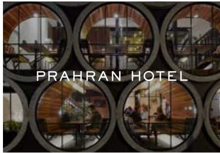
82 HIGH ST, PRAHRAN PRAHRANHOTEL.COM