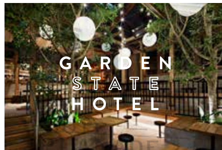
101 FLINDERS LN, MELBOURNE GARDENSTATEHOTEL.COM.AU