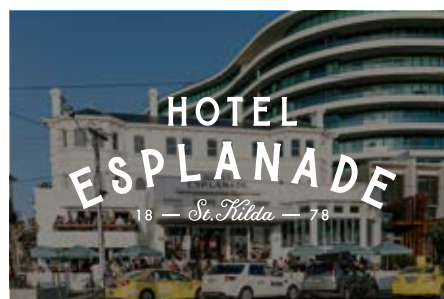
11 THE ESPLANADE, ST KILDA HOTELDESPLANADE.COM.AU