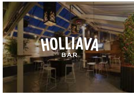
36 SWAN ST, RICHMOND HOLLIAVA.COM.AU